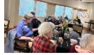
THIS MONTH'S MEETING INFO