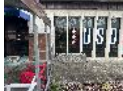
DONATE - PAY DUES USO NORTHWEST