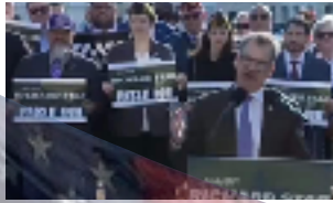
ADVOCACY FOCUS WA STATE VSO