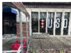
DONATE - PAY DUES USO NORTHWEST