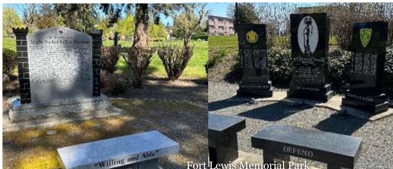
Fort Lewis Memorial Park

Who doesn't like a discount? Check the latest exclusive member discounts and more at: https://www.moaa.org/content/benefits-and-discounts/MOAA-exclusive-discounts/