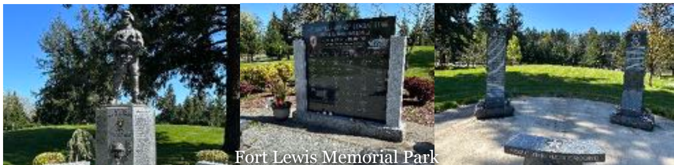
Fort Lewis Memorial Park