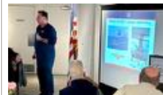
THIS MONTH'S MEETING INFO MEAL ORDER