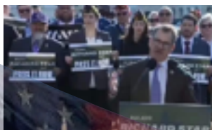
ADVOCACY FOCUS WA STATE VSO