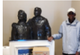
DONATE - PAY DUES FISHER HOUSE