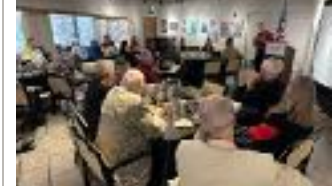
THIS MONTH'S MEETING INFO MEAL ORDER