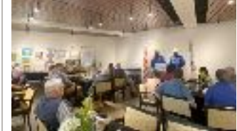
THIS MONTH'S MEETING INFO MEAL ORDER