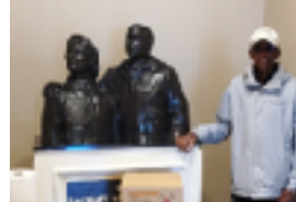
DONATE - PAY DUES FISHER HOUSE