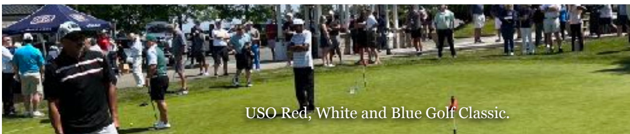
USO Red, White and Blue Golf Classic.