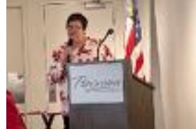
DONATE - PAY DUES SANTA'S CASTLE