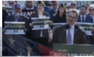
ADVOCACY FOCUS TRICARE AT RISK