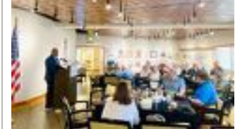
THIS MONTH'S MEETING INFO MEAL ORDER