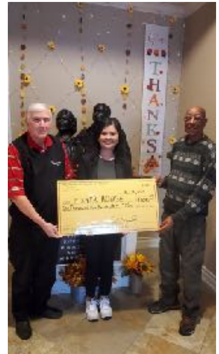
Olympia MOAA presenting Fisher House Donation

Editorial Policy: The Olympia Area Chapter of the Military Officers Association of America (MOAA) and national MOAA provide their advocacy in a nonpartisan manner. Any inference of partisanship is unintended. The Olympia Area MOAA is not liable or responsible for the content found in the links to other websites.