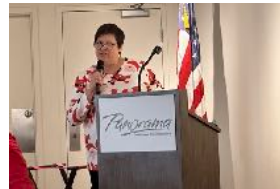
DONATE - PAY DUES SCHOLARSHIP