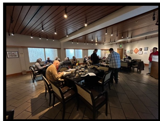
St. Martin's University students present their MOAA app project to us at February's meeting.

Editorial Policy: The Olympia Area Chapter of the Military Officers Association of America (MOAA) and national MOAA provide their advocacy in a nonpartisan manner. Any inference of partisanship is unintended. The Olympia Area MOAA is not liable or responsible for the content found in the links to other websites.