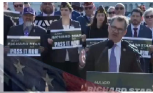
ADVOCACY FOCUS MEMBER OF MONTH