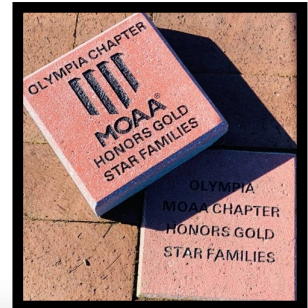
Our brick paver at the Gold Star Families Memorial Monument in Lacey

If anyone would like a ride or wants to carpool, mention that when you RSVP and something can be arranged.