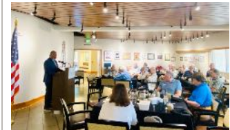
THIS MONTH'S MEETING INFO MEAL ORDER