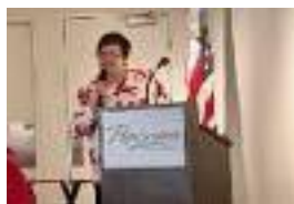
DONATE - PAY DUES SCHOLARSHIP