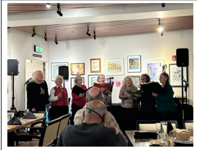
Entertainment Explosion performs at the December Chapter Meeting.