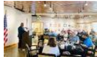
THIS MONTH'S MEETING INFO MEAL ORDER