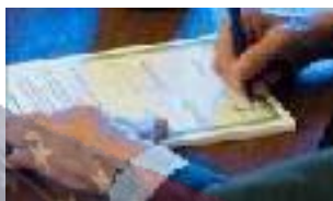
ADVOCACY FOCUS MEMBER OF MONTH