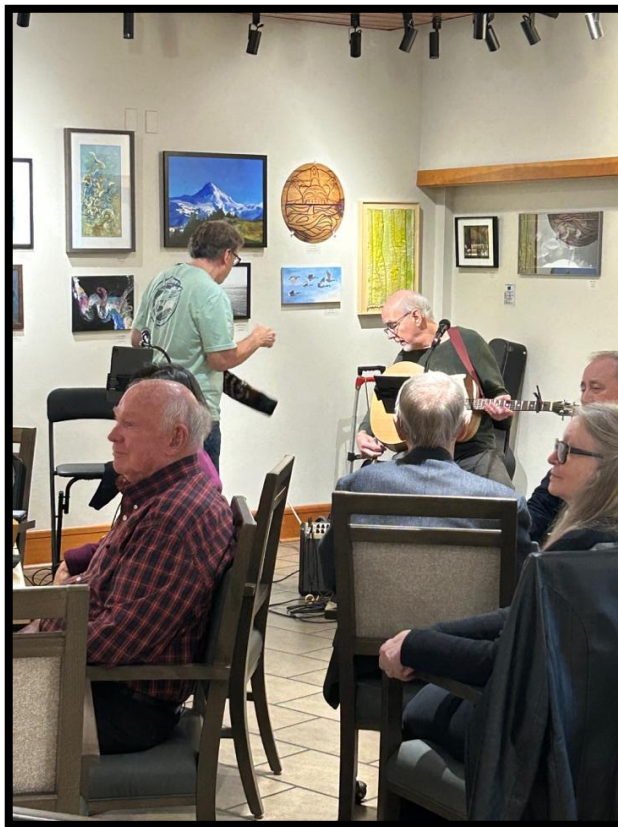
Left: Slots introducing the entertainment. Right: Latitude 47 setting up.